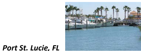
Port St. Lucie, FL