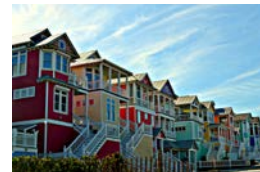
Atlantic Beach, NC