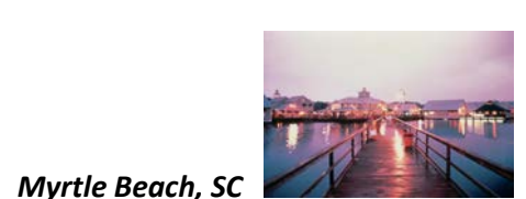
Myrtle Beach, SC