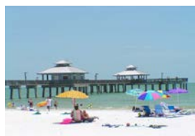
Fort Myers, FL