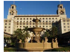
Palm Beach, FL