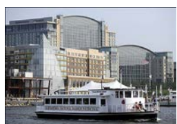
National Harbor, MD